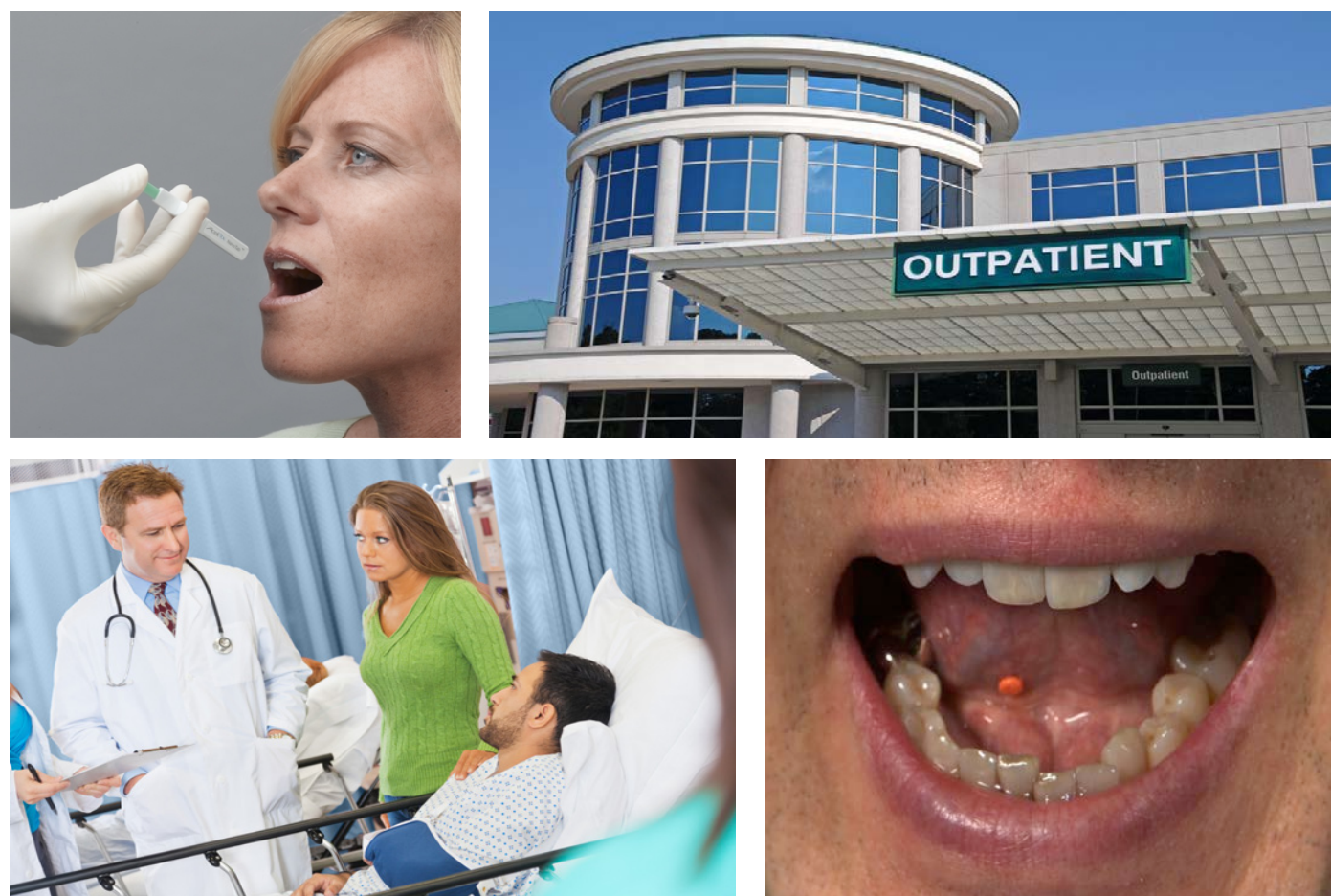
Figure 1. Sufentanil Sublingual Tablet 30mcg

Ambulatory surgery, coming to and leaving the hospital on the same day as surgery, is increasingly being adopted in Europe due to its cost effectiveness and improved quality outcomes. This considerable growth has been facilitated by the advent of minimally invasive procedures that have enabled healthcare professionals to perform multiple surgeries in a day. 1 Timely discharge demands a rapid recovery and low incidence of surgery and anesthesia related side-effects such as pain, nausea and fatigue. 2 Patients must be fit enough and symptom intensity mild enough to facilitate self-care, so there remains a clinical need for rapid-acting, potent analgesics that offer predictable offset and good tolerability. The sufentanil sublingual tablet 30mcg (SST) is in development for treatment of moderate-to-severe acute pain in medically supervised settings such as day surgery (Figure 1). The product is designed to leverage sufentanil's distinct pharmacodynamic properties and could offer potential analgesic advantages in short stay situations. 3-5 The primary objective of this analysis was to compare the efficacy and safety of SST by procedure type, to placebo (PT) for the management of moderate-to-severe acute post-operative pain following abdominal surgery.